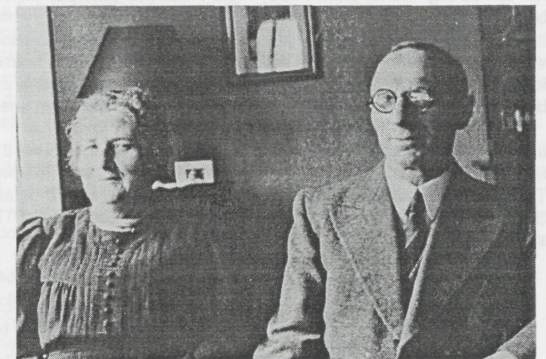
My parents. In our living room at Oranjeplein 2, The Hague (1941)

My father always said, "Your mother knows how to make a quarter out of a dime." We had company everyday because all the friends and family knew that there was always somebody home, so they just came by. If my mother was not at home, they visited with my father in the "kleermakerij".