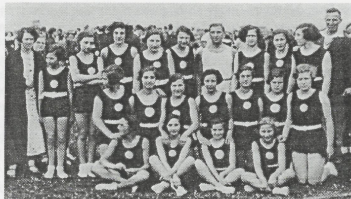
Jewish Gymnastic Club

their children perform? There was also lots of good food for sale those evenings. Like "broodjes half om" (half corned beef and liver worst sausage) and gebakjes (pastry). But, it was too much money for my mother to buy all this for us. But, as with everything else, she had a perfect solution for this problem. At home she prepared everything and brought it with her to eat that evening. That way, we did not feel left out and it was much more reasonable. Quite often our "broodjes" and "gebakjes" tasted better than the stuff they sold at the stands.