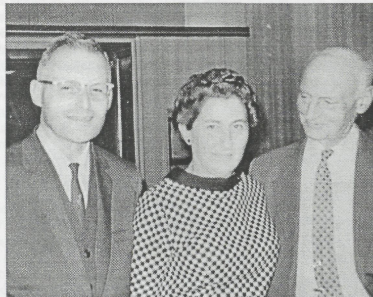
Photo taken in September, 1967 in Amsterdam on a visit to Holland. Sal, Rose, Otto Frank.

I ended up in a labor camp in a little town named Liebau in upper Silezie, part of Poland, with about 200 other Jewish prisoners. We had to work in a factory where we made snowchains for military trucks. After a couple of months, they ran out of material. Then we were put to work in a field where we had to make a landing strip for airplanes. We had to make rock, by blowing up parts of a mountain with dynamite. Then carry those rocks to the field for a landing strip. The fact that I also speak German and French helped me a great deal during my imprisonment. It was very important to be able to understand the instructions given by the women soldiers who were our guards. I could also overhear their conversations. They became more and more discouraged about the outcome of the war, which made us feel better. I never let them notice that