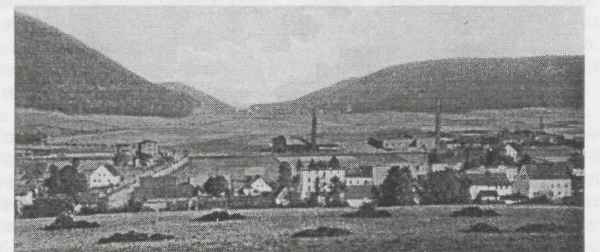
The town of Liebau where I worked in a labor camp from October 29, 1944 to the end of the war on May 7, 1945.