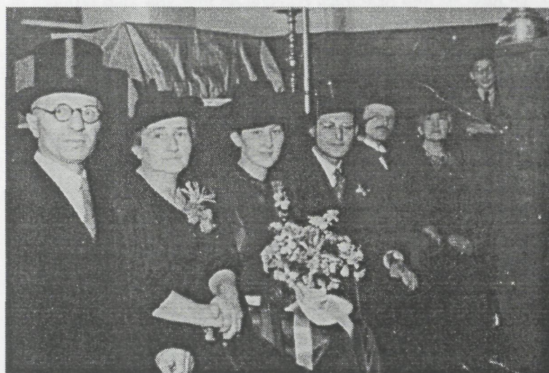
Our wedding took place at the synagogue in The Hague on the Nieuwe Molstraat.

In November 1942, early one morning, they came to Papa's house to pick up Opa, Oma and Papa. Of course, Papa told them that his parents were picked up months ago during a "street razzia" and he had not heard from them since. They accepted that story because the "verwalters", who thought it was true, told them the same thing. They let Papa go free for the time being due to his "sperr". But the house was sealed and Papa had to get out and was only allowed to take his clothes. He moved in with us and slept in one of the small bedrooms up in the attic. We knew for sure now that things were closing in on us and we were running out of time quickly. Then Papa and I decided to get married. At least we would legally belong together and would be able to stay together