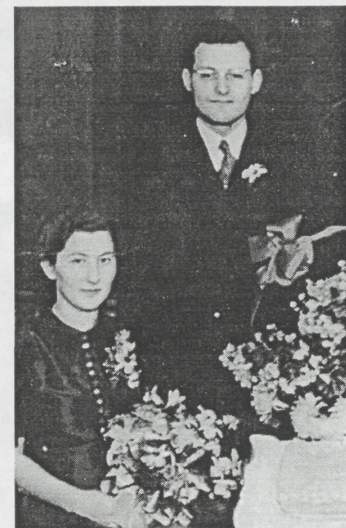
Our wedding day, December 20, 1942, in my parent's house. My bouquet and the ribbon on the basket cover the yellow "Jood" stars we were forced to wear.

My mother's second cousin had a job with the Jewish Council in the department "help to deporting Jews." He offered my brother a job there to ride a three wheel carriage bike. This was to help carry the backpacks for the Jewish people who were picked up by the Germans. Through that job my brother got a "sperr". Of course, there was no pay involved. But, really every day you could manage